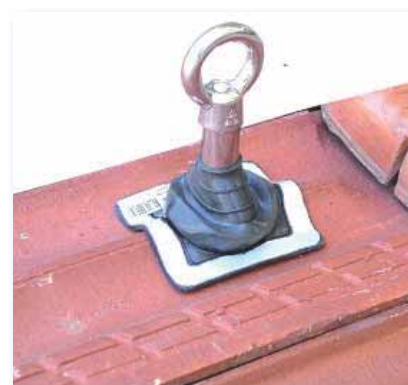
L4544 Truss Mounted