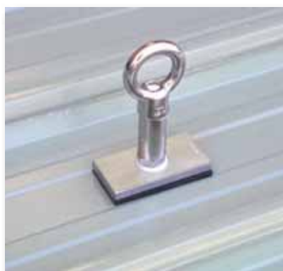
L4543 Purlin Mounted